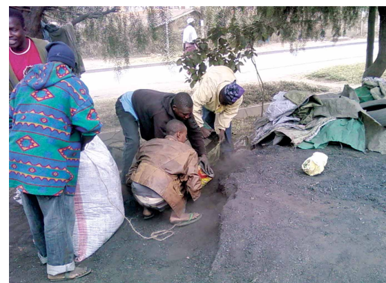
Charcoal waste dust, used by the author to improve the fertility of tropical soils, is gathered at an urban charcoal market.

Biochar-producing stoves that burn pellets that are waste-derived or sustainably produced are being introduced in Africa. These stoves have separate chambers for pyrolyzing some of the pellets and producing biochar for soils. Pioneering efforts are being made by a few NGOs (non-governmental organizations) to quantify the amount of this stove-derived biochar going into soils, a